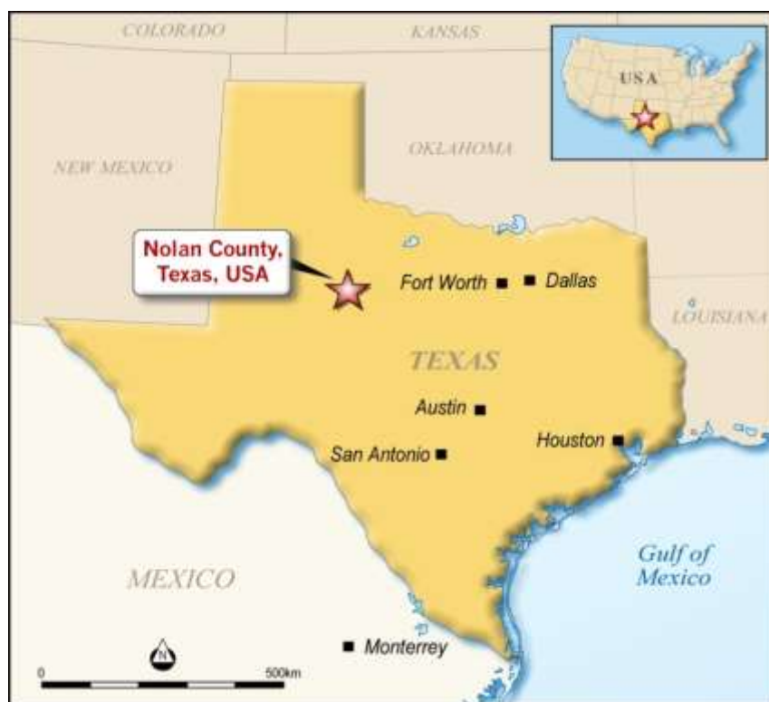
Figure 1: Location of the Company's 19,110 net acres in Texas, USA

Winchester was established in 2014 with the objective of acquiring oil and gas leases and working interests in areas situated on the Eastern Shelf of the Permian Basin in Texas, USA, a location which offers prospective Cline Shale unconventional oil opportunities at shallow depth together with attractive conventional oil targets, such as the Ellenburger Formation, at slightly greater depth. Concurrent with establishing a reasonably sized land position in the Eastern Shelf of the Permian Basin in Texas, Winchester commenced exploration drilling with subsequent oil and gas production achieved in early 2015. As at the date of this Prospectus, Winchester had acquired 19,110 net acres by way of six oil and gas leases in the highly productive Eastern Shelf of the Permian Basin in Texas, USA.