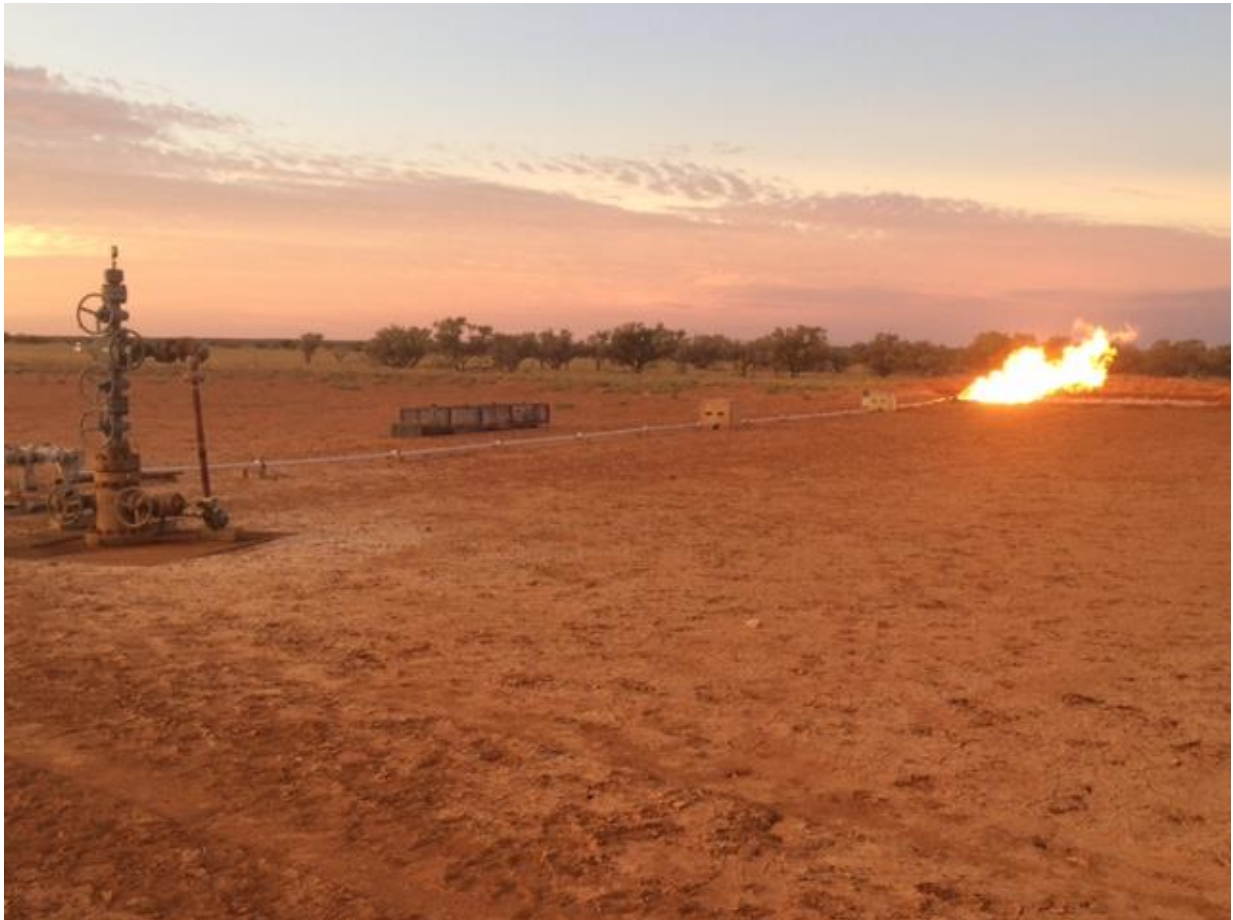
Picture of Tamarama -1 well gas flare during recent flowback operations

Real Energy Corporation Limited (ASX: RLE and Real Energy) is pleased to provide an update to shareholders for the quarter ended 31 March 2017. The Company continued to progress exploration and development activities at the Windorah Gas Project in the Cooper Basin.