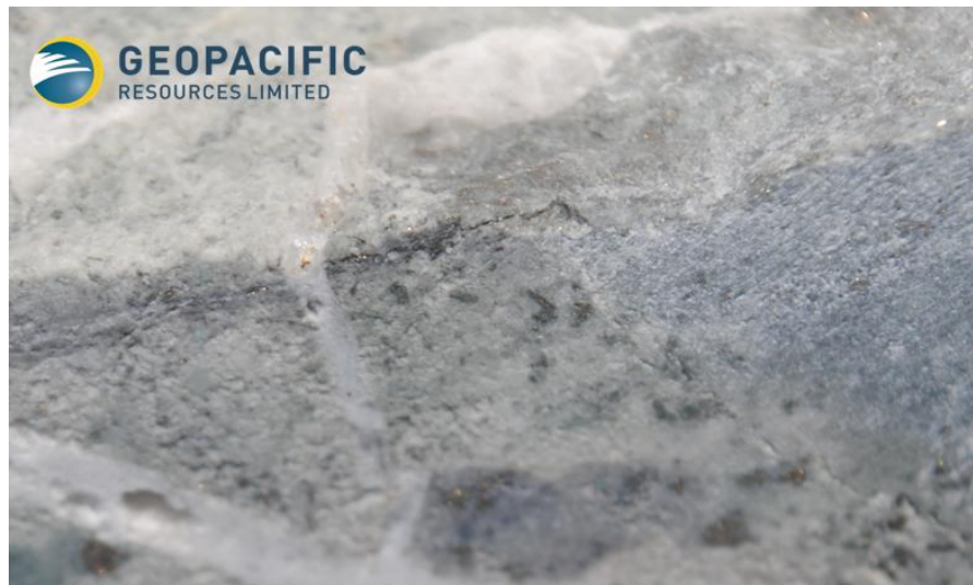
Figure 1: Visible gold in diamond hole KU17RD004

The holes were designed to test for extensions to known mineralisation to the south of current Kulumadau West pit design. The results demonstrate a successful outcome, showing obvious potential to upgrade Woodlark's Resource inventory and deliver the plan to increase Reserves to 1.2 million ounces.