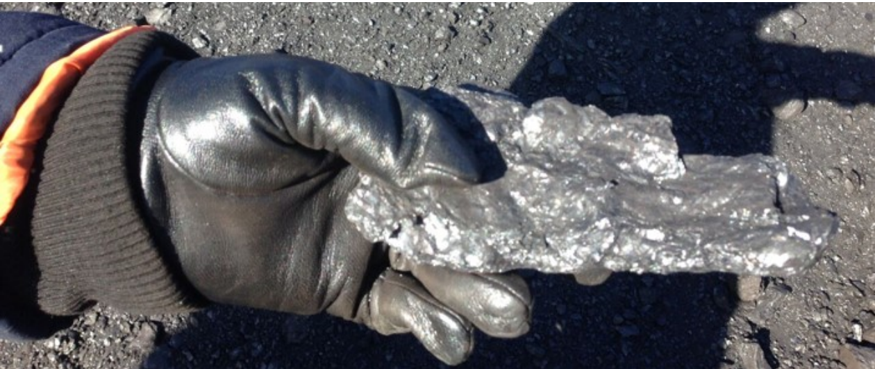
Images: Coal mined and delivered to ROM stockpile at BNU Hard Coking Coal Mine