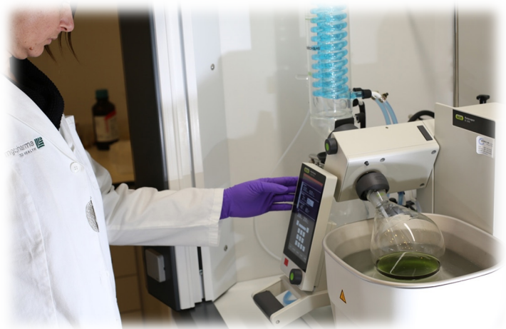
Image: MGC Pharma Laboratory

This Slovenian facility will allow MGC Pharmaceuticals to produce its first cannabidiol (CBD) Active Pharmaceutical Ingredients (API) grade product by Q2 2017.