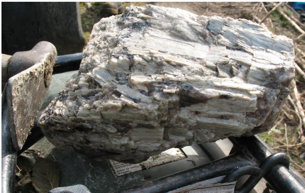
Figure 1. Example of high quality white spodumene crystals discovered during the excavations of pegmatite exposures south of the North Aubry prospect, Seymour Lake Lithium Project

The Seymour Lake Project, which is located near the town of Armstrong in Ontario, now encompasses 34 mining claims (11 granted and 23 pending) covering an area of 7019 Ha, and has over 4,500m of historical diamond drilling which confirmed the presence of extensive spodumene mineralisation (a host rock to lithium).