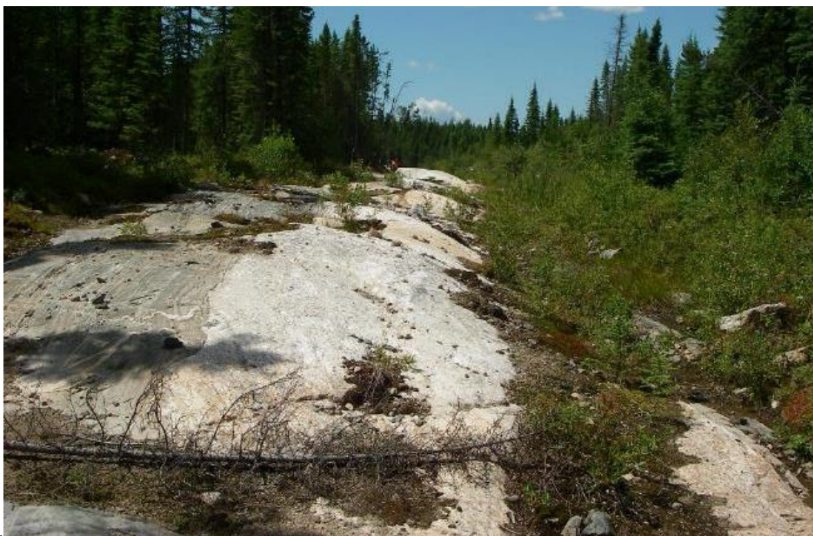
Figure 4. Visible spodumene mineralisation in the extensive outcropping of the Root Lake Pegmatite.