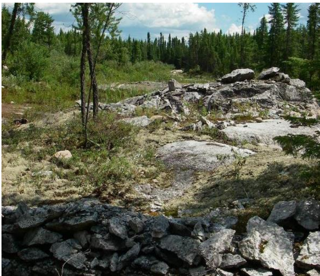
Figure 5. Further visible spodumene mineralisation at the outcropping Root Lake Pegmatite.