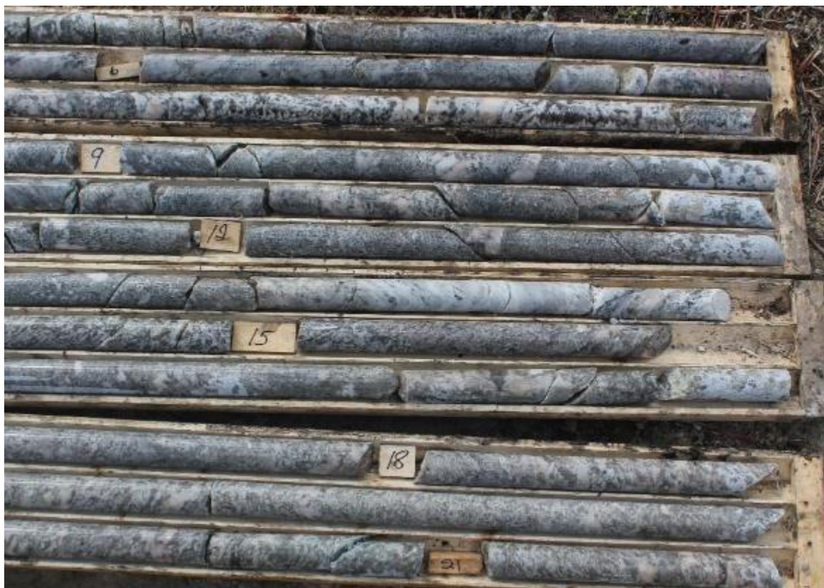
Figure 3. Drill core from the McCombe Pegmatite at the Root Lake Project showing multiple intersections of spodumene mineralisation.

The limited due diligence drilling previously completed by Ardiden confirmed multiple mineralization zones at the McCombe prospect.