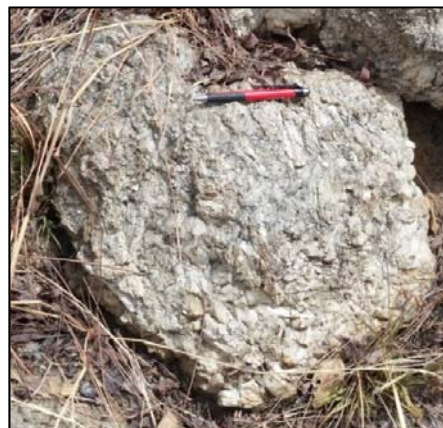
"Crowded" spodumene rock at Goulamina