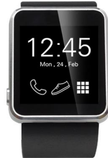
SENIOR SMARTWATCH SAFETY