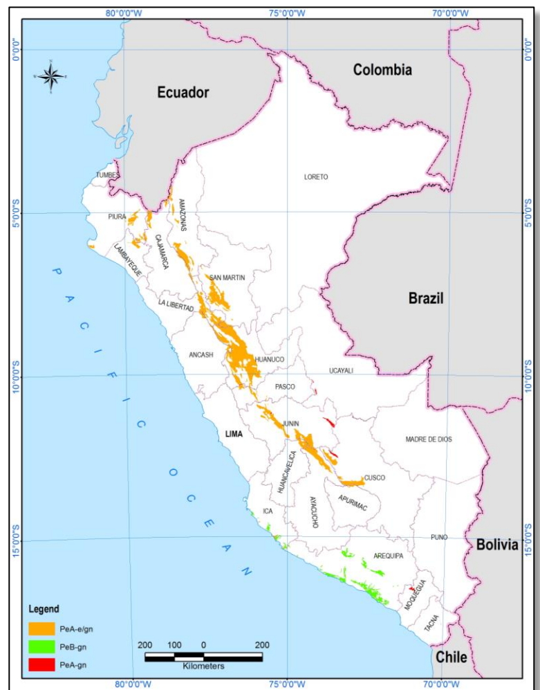
Figure 4 – Precambrian Gneiss Belts in Peru