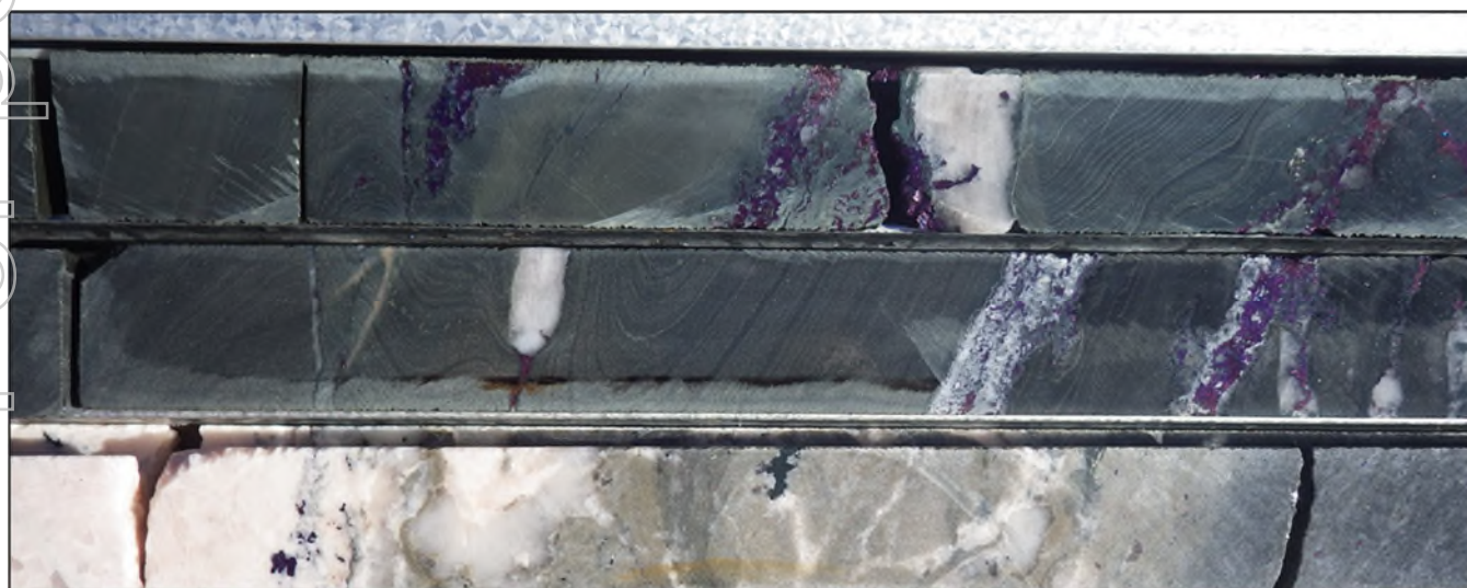
Figure 3: Example of Bornite vein hosted mineralisation in drill core from MO-G-01D (Assays awaited)