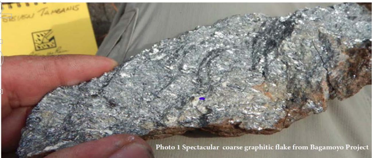
Photo 1 Spectacular coarse graphitic flake from Bagamoyo Project

In addition to being ideally located close to port, rail, power and water, we are particularly excited by the mineralisation observed at the project which includes the coarsest flake graphite the Company has observed in Tanzania. Given the exciting nature of the mineralisation and favourable location, the Company has taken the opportunity to secure an extensive tenure position in the region."