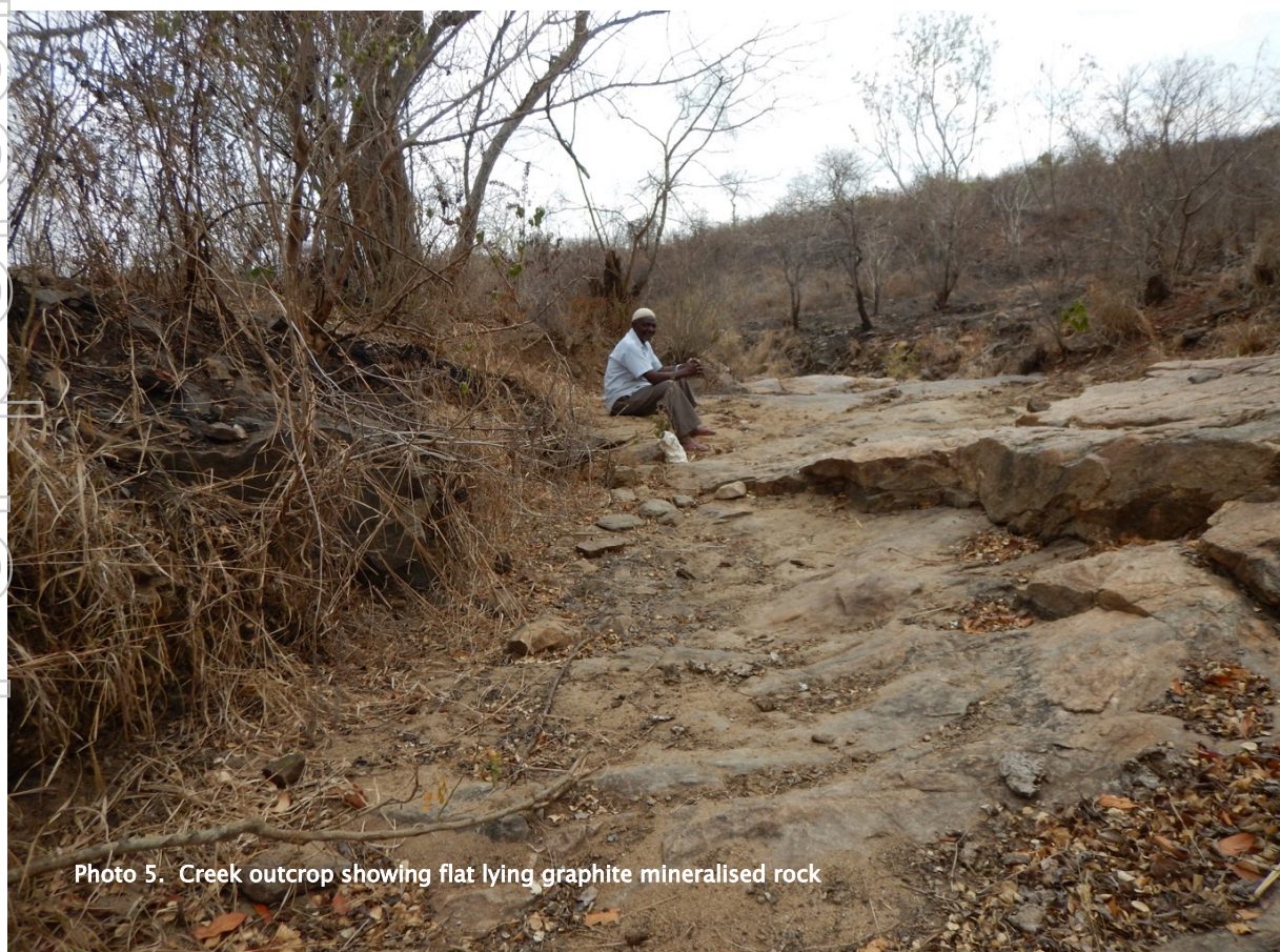
Photo 5. Creek outcrop showing flat lying graphite mineralised rock