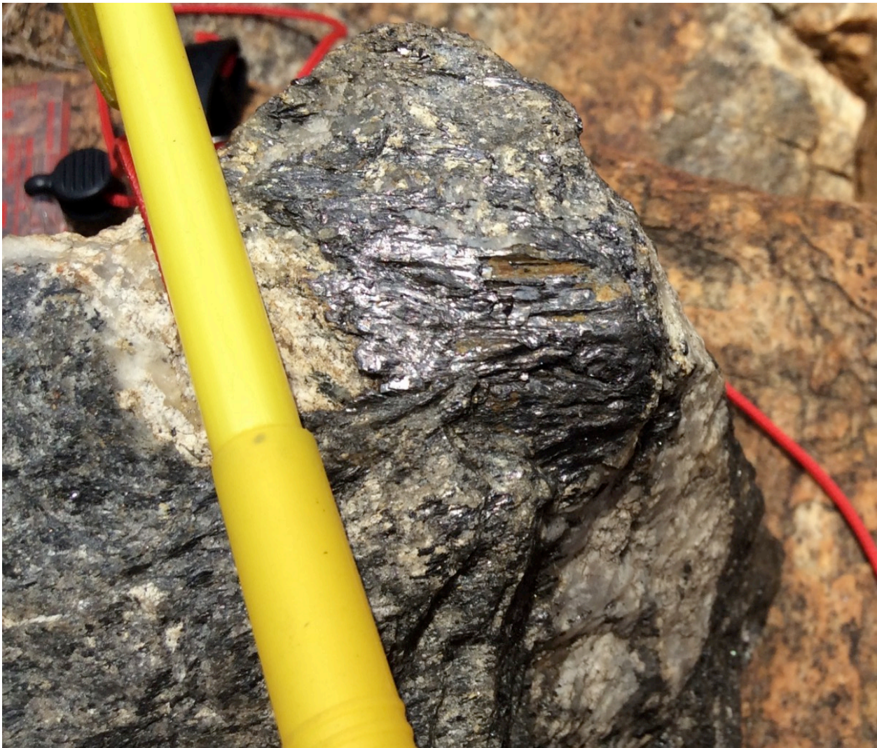
Photo 3. 40mm massive graphite flake aggregate, the largest observed by the Company in Tanzania.

Preliminary analysis indicates exceptionally coarse flake graphite mineralisation, with typical graphite flake size of 2-7mm and many occurrences >10mm. The indicative graphite grade observed is 7% TGC which, whilst lower than Mahenge, has the potential to result in a premium product given the very coarse flake. Outcrop samples have been dispatched to Australia for flake characterisation.