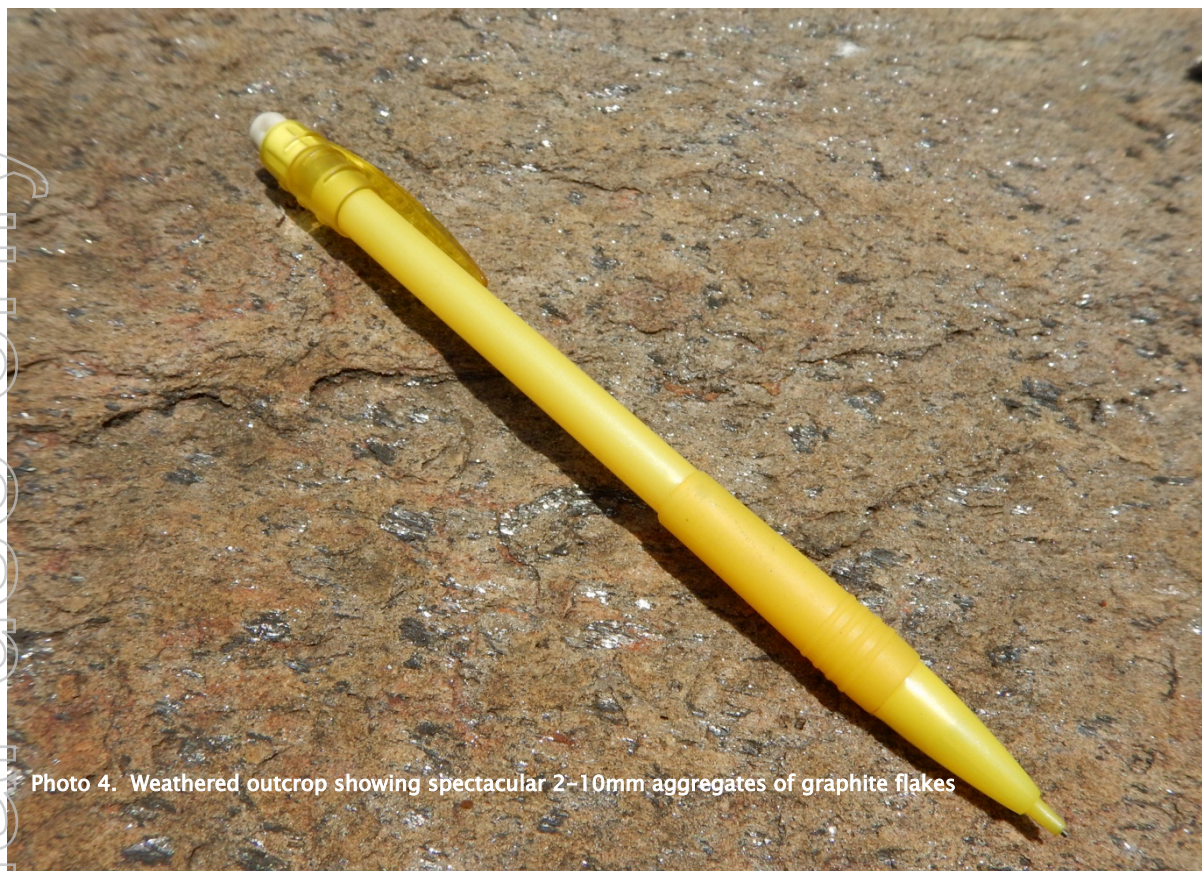
Photo 4. Weathered outcrop showing spectacular 2-10mm aggregates of graphite flakes