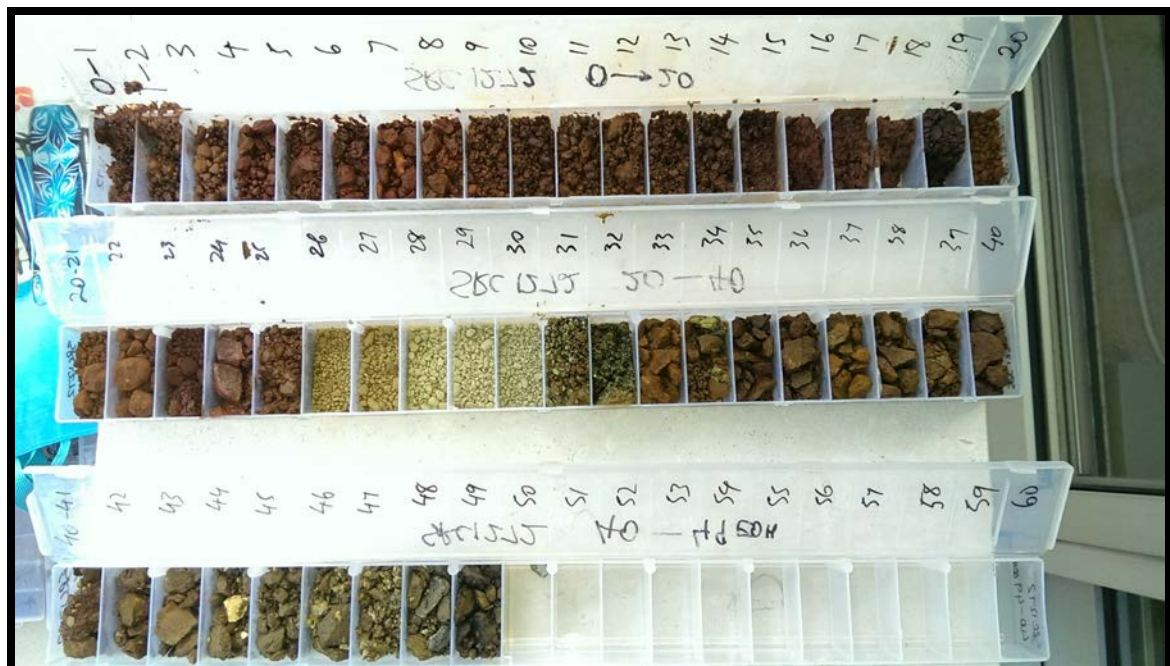
Figure 3: Hole SRC1272 chip tray showing 1m intervals through laterite profile, ending in basement ultramafic

Two meter samples were collected using a riffle splitter on the drill rig then sent to ALS in Brisbane via preparation lab in Orange to be assayed using both ICP-MS and Borate Fusion analytical techniques. Both Techniques were used to assess any differences in the scandium results for future reference and to assist with interpretation of historical drill results. One fully certified scandium standard and two identical duplicates per hole were also assayed for QA-QC purposes.