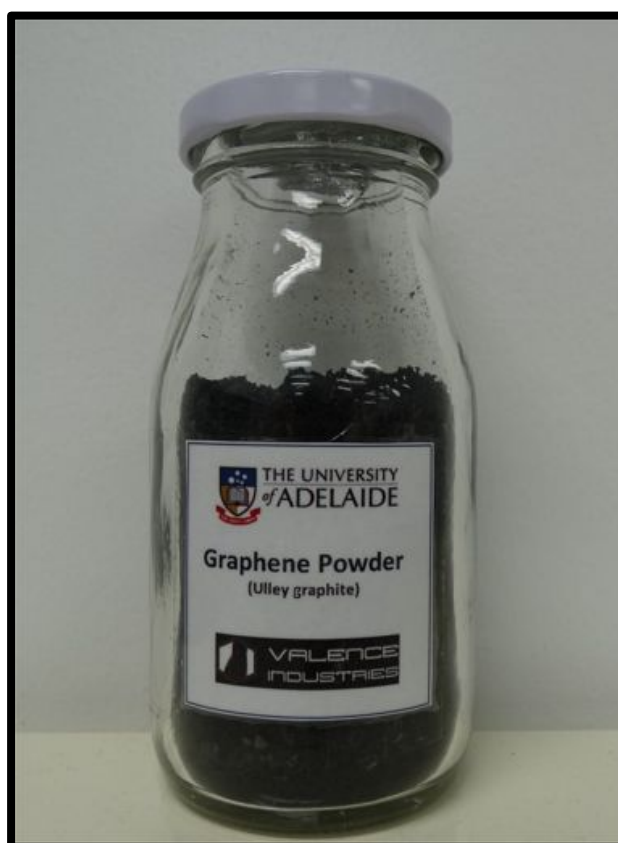
VALENCE INDUSTRIES - GRAPHENE POWDER

Processed graphite from the Valence Industries is now being made available to the University of Adelaide. That graphite will be used for ongoing assessment and development of a range of graphene products for commercialisation as well as a program of graphene sales.