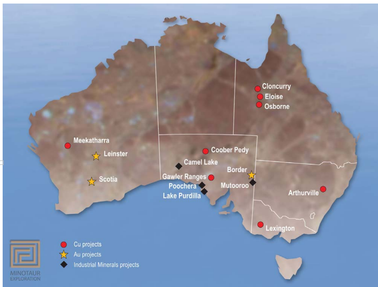
Minotaur's and Breakaway's Project Locations