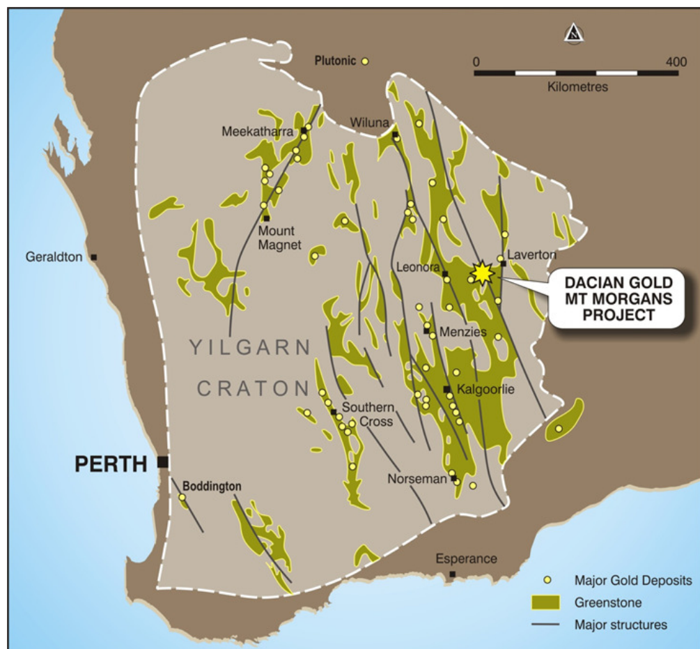
Figure 1: Dacian Gold Limited Project Location

Exploration work has commenced at the project. A geophysical crew is currently on site undertaking a gravity survey at the Cameron Well prospect. In addition, all required approvals have been received and contractors engaged to allow drilling to commence during November. Initial drilling programs have been planned to test for high grade extensions to the Morgans North and Transvaal-Ramornie areas. These zones have excellent potential to host gold mineral resources additional to the 840,000oz already reported at the project.