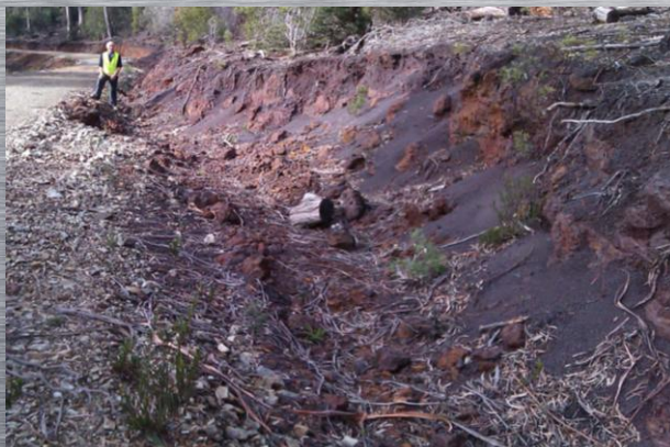
Riley DSO project surface deposits

The Riley discovery is very important for Venture given that any future operation will be very cost effective, there will be very minimal capital requirement to commence production and the project should quickly become cash flow positive.