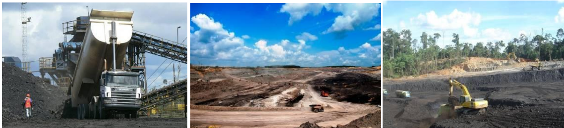
Bayan mining operations in East Kalimantan

Bayan is a significant Indonesian-listed coal mining and processing company with integrated operations covering the full spectrum from mining to processing, logistics and sales.