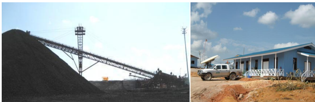
Site infrastructure established at the Pakar Thermal Coal Project