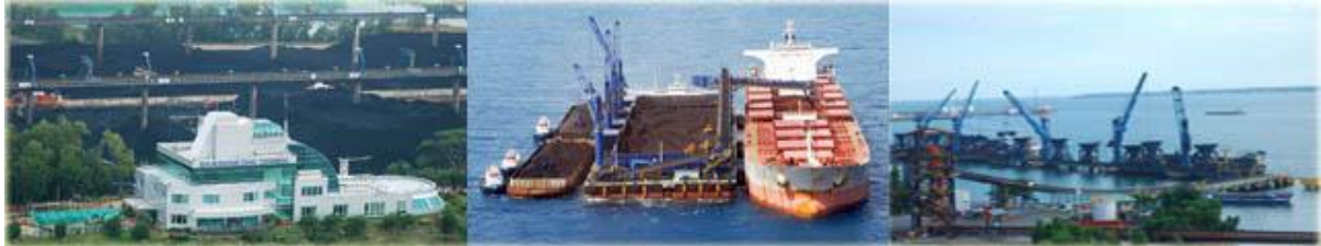
Bayan infrastructure established in East Kalimantan

As a result of this extensive mining, processing and logistical expertise, Bayan recognizes that it can add substantial value to KRL by realising synergies, economies of scale, technology, experience and expertise – all of which can rapidly escalate KRL's portfolio of Indonesian coal projects to their full capacity.