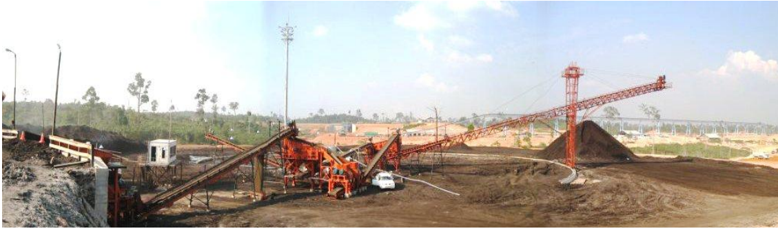
Site infrastructure established at the Pakar Thermal Coal Project

KRL will be drawing on the experience and the expertise of Bayan Resources, to assist in all aspects of moving Pakar into production in 2011.