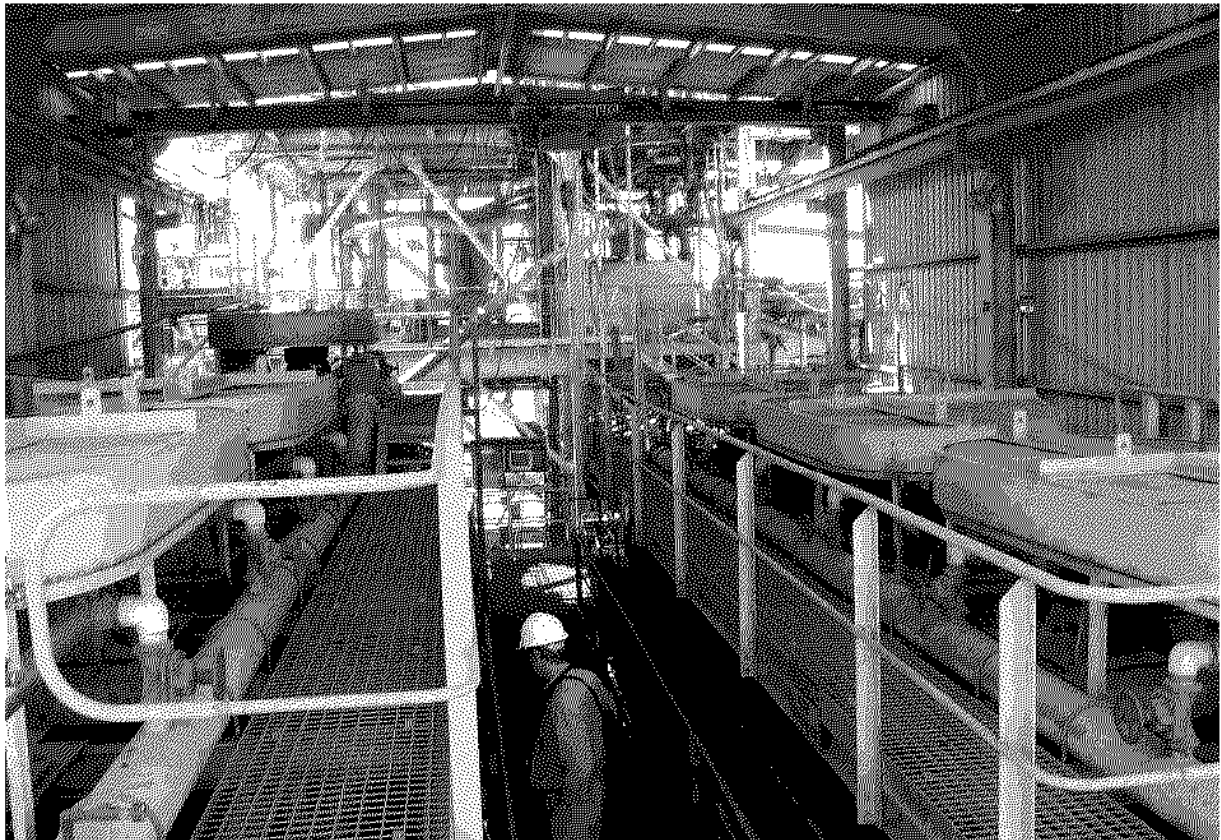
The flotation circuit acquired as part of the Telfer sulphide plant

Results from recent T5 drill holes are expected to be released early next week.